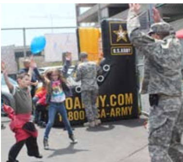
The US Army got everyone working hard!