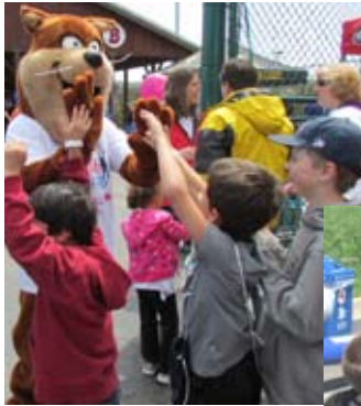
Scat Cat made the rounds with Free High Fives at FFD this year!

On Sunday, May 18th, we held our longest running fundraiser for the 19th year at Coca-Cola Field. The event was a great success, raising more than $23,000 after expenses in support of the WNY United Foundation. We are honored to host this event at the home of the Buffalo Bisons during an afternoon game every year. Families are invited to celebrate the start of summer with bounce houses, carnival games, free sno-cones and more - all for a very reasonable price!