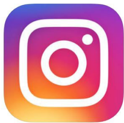
Photo & Video Sharing Apps