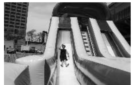
Loving the giant inflatable slide.