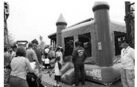
Inflatable fun by ABC Rentals.